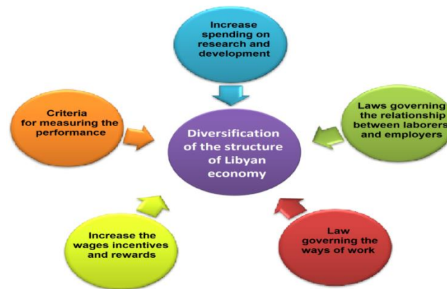
Figure (2): The relationships between the elements in scenario 1

What is more, skills development also means enabling people of working age to acquire skills which are needed by economic sectors currently and in the future. On the other hand, an unemployment in a more diverse economy is more stable over business cycles than in a less diverse economy. Thus, it can be concluded that, in general, economic diversification in small economies -as Libyan economic - should lead to greater cyclical stability. With regard to relationships between the elements in this scenario could take the trends that shown in the Figure (2).